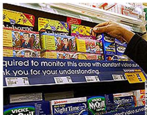
Airborne, which contains herbs, vitamins and echinacea, sits next to FDA-approved drugs at a Walgreens drugstore.

Zicam and other homeopathic products do say on their packaging that they are homeopathic. Zicam, which contains a small amount of zinc, is the nation's third leading nasal spray. Airborne -- plugged on Oprah Winfrey's show last fall -- is an effervescent tablet containing Chinese herbs, vitamins and echinacea. Its label notes that the FDA has not reviewed its